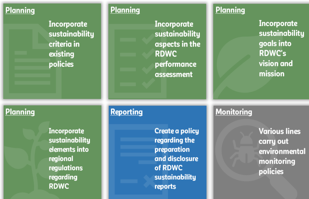
Figure 2 Policy Proposal Summary

The last proposed policy is that various lines carry out environmental monitoring policies. This policy will include supervision of water resource utilization operations carried out by RDWC. Supervision can involve but is not limited to collaboration with institutions in local government, such as the Public Works and Spatial Planning Department, the Water Resources Management Service, the Environmental Service, and the Regional Inspectorate. Supervision in the area can be conducted more intensively, considering the location is close, and the supervisors know the area conditions and characteristics better. Besides, supervision must also be carried out periodically by the central government, which can be performed but is not limited to the collaboration of the Ministry of Public Works and Public Housing, Ministry of Environment and Forestry, Ministry of Home Affairs, BPKP, and others. Good monitoring of RDWCs regarding the environment is hoped to provide an early warning system regarding managing the water resources they use.